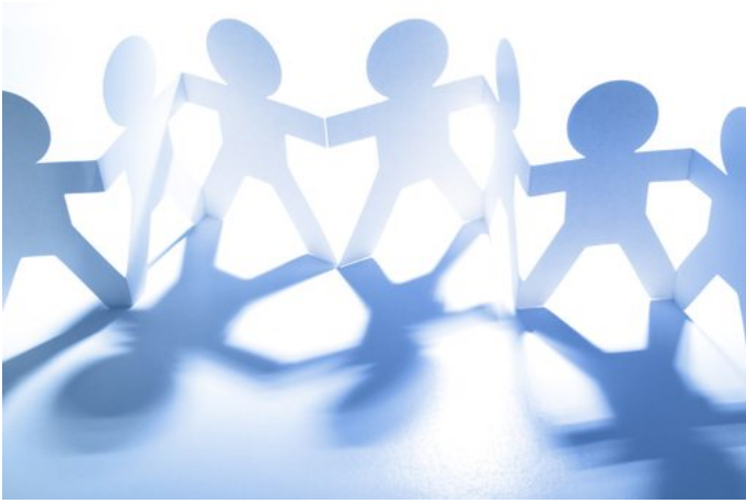
Mass Tort & Class Action