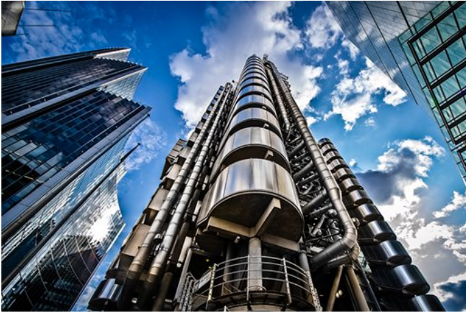
Insurance Defense & Coverage