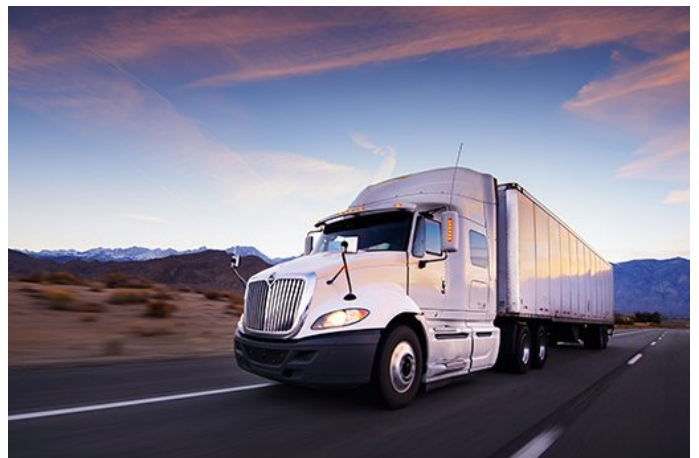
Trucking & Transportation