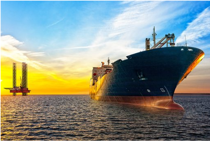
Maritime & Admiralty